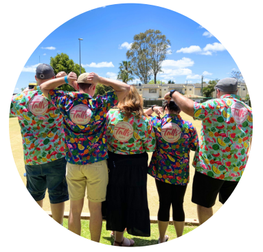
NEW...BUT WITH HISTORY

Raising money for the Toowoomba Hospital Foundation, and focusing on men's mental health, the QHA is proud to give back to the local community.